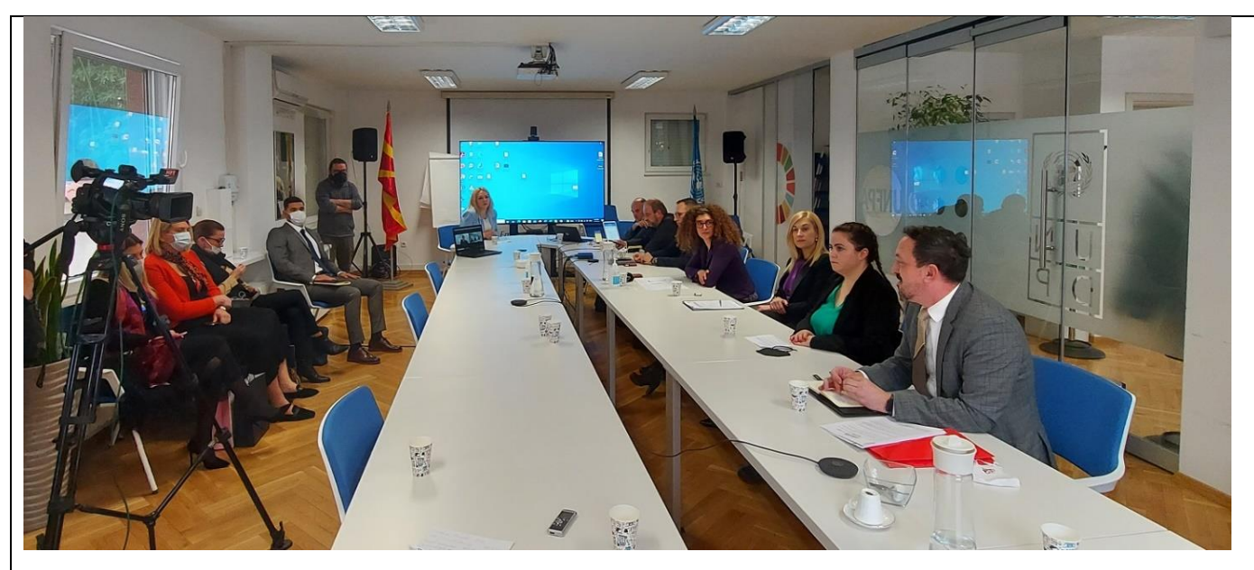
Representatives of the North Macedonian, Serbian and Albanian Government, and UNDP offices from the three countries, ODA event in Skopje, North Macedonia, April 2022